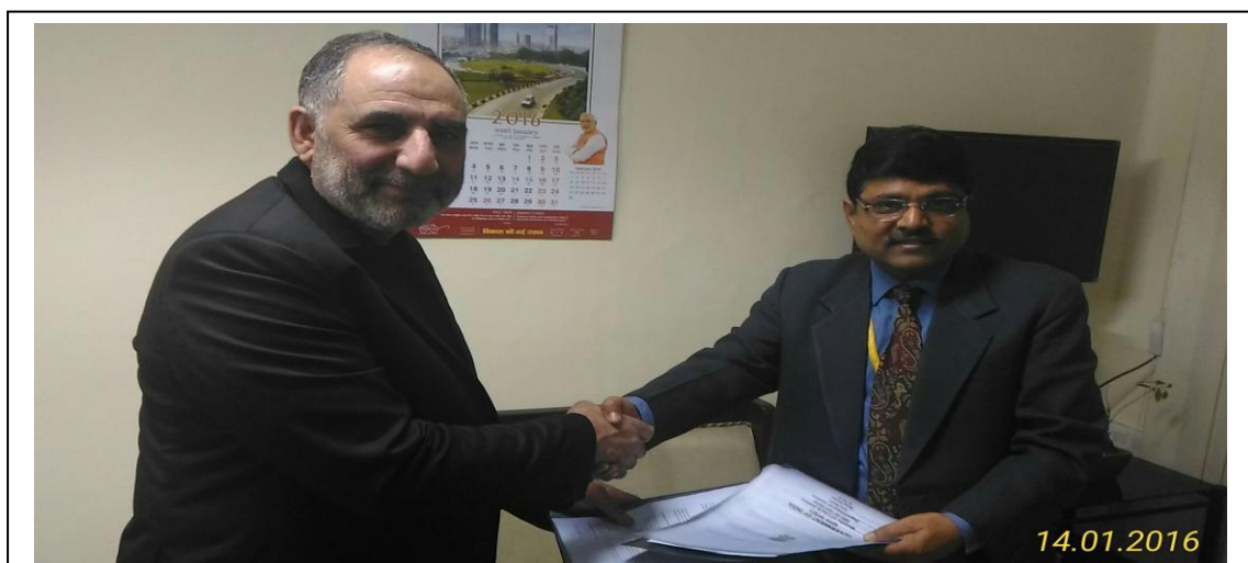
Figure 3: MoA signed between DoJ & SRC

7. MoA signed with State Resource Centre, Srinagar: On 14 th January 2016, DoJ has signed MoA with SRC, Srinagar. With the signing of agreement, legal literacy activities will be initiated. First of all, a review workshop will be conducted to prepare IEC (Information Education Communication) material for legal literacy. The first activity is yet to start.