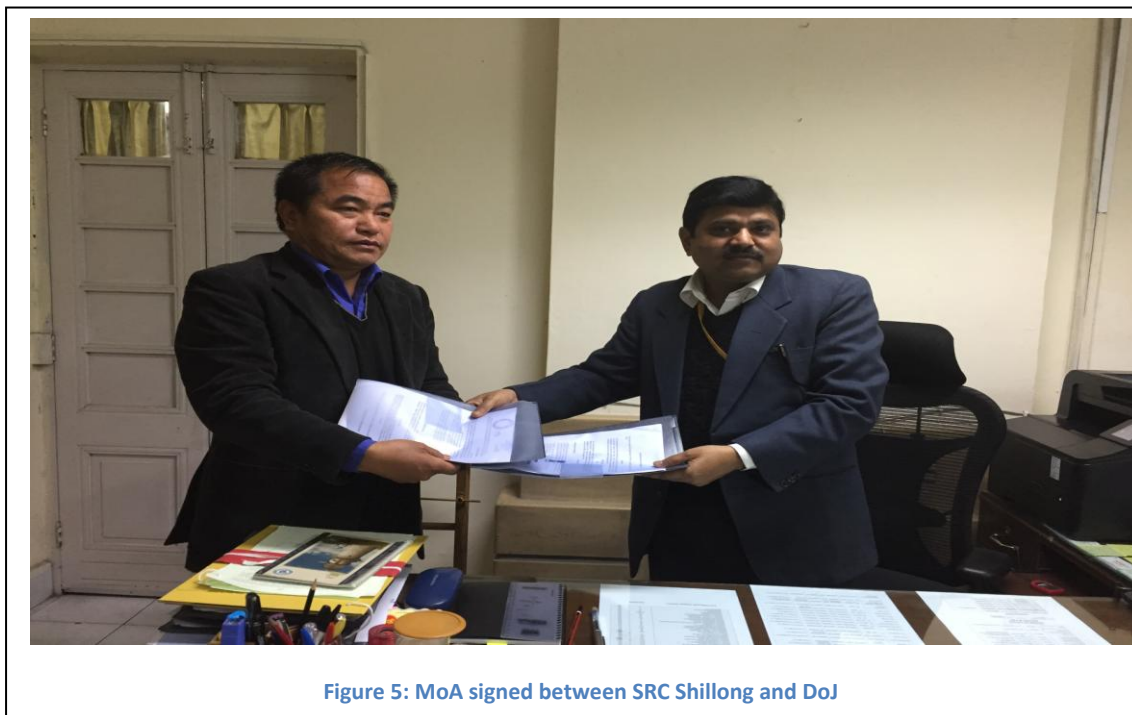
Figure 5: MoA signed between SRC Shillong and DoJ

9. MoA signed with State Resource Centre, Shillong: On 21 st January 2016, MoA was signed between DoJ and SRC, Shillong to initiate Legal Literacy activities (Preparing IEC Material, Training of RPs/MTs/Preraks) for legal empowerment of marginalized community in North eastern States(Meghalaya, Nagaland and Manipur). IEC material review workshop has been completed and literature has been updated as per local need in terms of issues as well as format of presenting laws in the simplest way with folk illustrations.