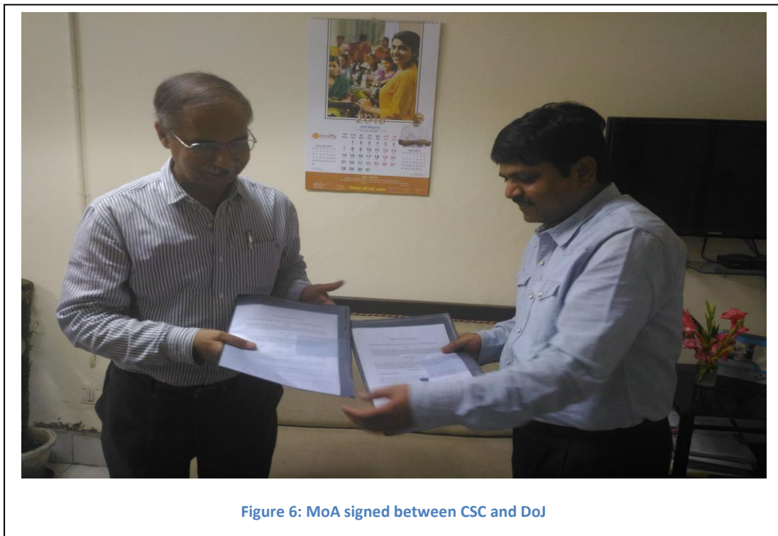
Figure 6: MoA signed between CSC and DoJ

11. MoA signed with Common Services Centre, Delhi : On 3 rd March 2016, DoJ signed MoA with CSC in 5 North Eastern States including Assam, Arunachal Pradesh, Meghalaya, Mizoram and Tripura. The programme would focus on training citizens on legal literacy and conducting legal literacy workshops especially for marginalized sections. It will conduct master trainings for Village Level Entrepreneurs (VLEs), who will organise legal literacy sessions and facilitate people in seeking justice through CSCs in different districts of five North Eastern States. On the same line, another MoA was signed on 23 rd March 2016 between DoJ and CSC to do legal literacy activities in remote areas of Manipur, Nagaland and Sikkim as well as J&K.