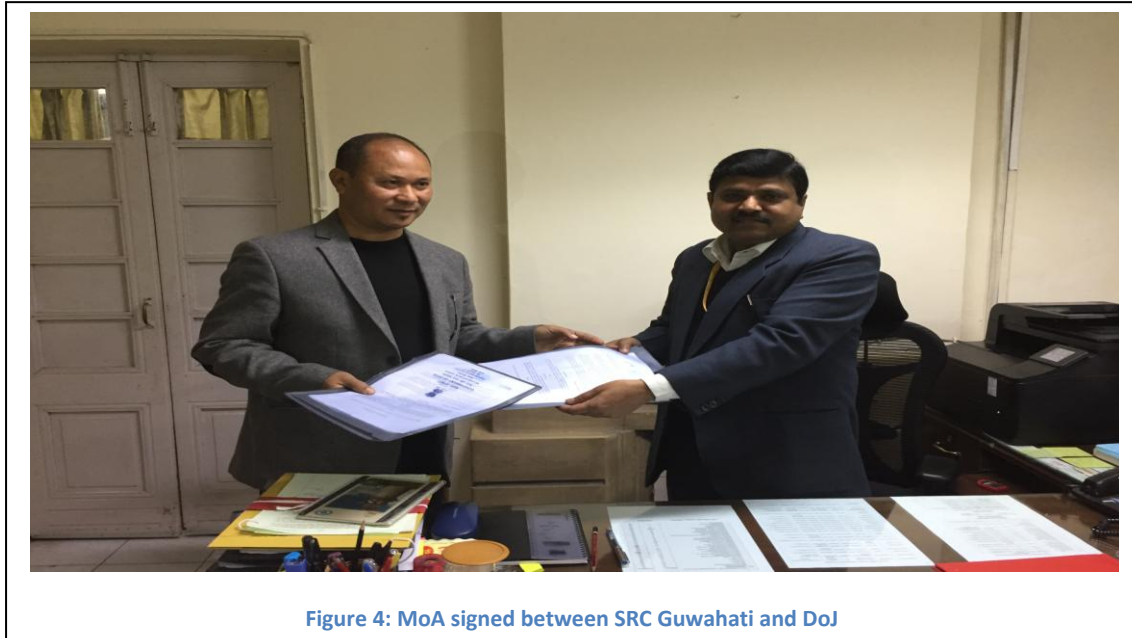
Figure 4: MoA signed between SRC Guwahati and DoJ

8. MoA signed with State Resource Centre, Guwahati: On 21 st January 2016, MoA was signed between DoJ and SRC, Assam to initiate Legal Literacy activities (Preparing IEC Material, Training of RPs/MTs/Preraks). IEC material review workshop has been completed by SRC Assam for 3 states namely-Sikkim, Assam and Tripura.